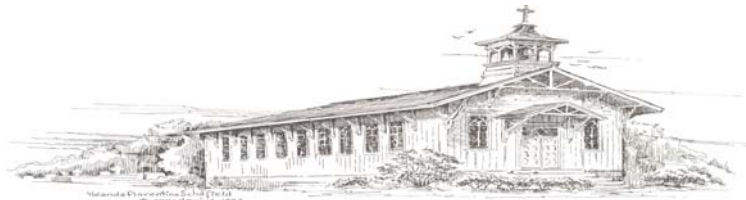
Miller Street Church